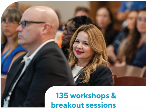
135 workshops & breakout sessions