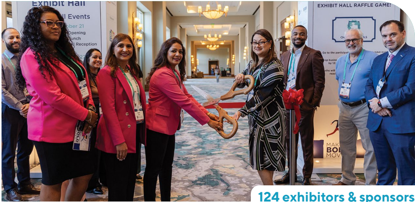
124 exhibitors & sponsors